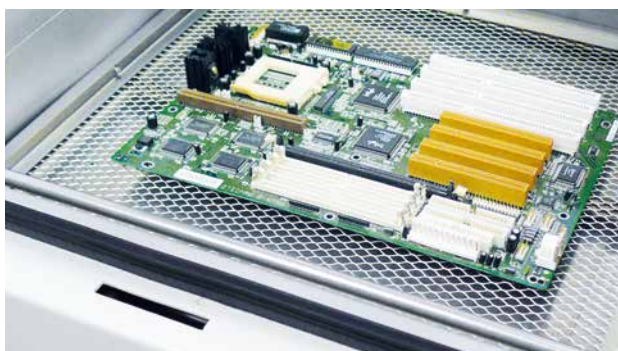
Work piece carrier with assembly at feed-in position

After opening the machine cover the solder product is placed on a work piece carrier. The process starts. An electric motor moves the work piece carrier with the assemblies to be soldered into soldering position. The PLC controls vapor production according to the set temperature gradients. Having reached the soldering temperature the work piece carrier is moved to the cooling position. The inner lock between process and cooling zone closes. The solder product is cooled by an effective blower system. After the cooling time has expired, a signal indicates release for removing of the work piece. An electromechanical guard locking prevents from opening the machine during production process.