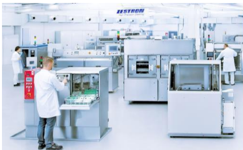
Machine Test Center