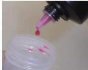
2) Add indicator