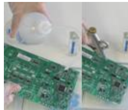
2) Rinse / Dry