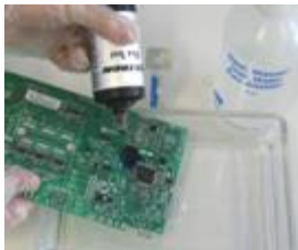
1) Apply indicator